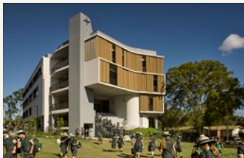
The Marian Centre, Brigidine College