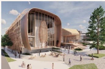
South Bank South Master Plan