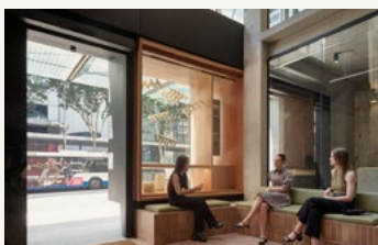
340 Queen Street, Brisbane