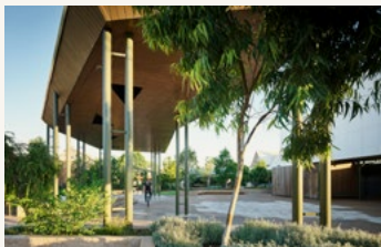
Mary's Place, Dalby