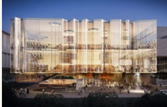
The Glasshouse Theatre, South Bank