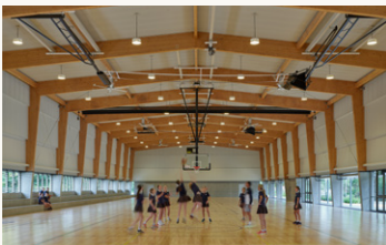
St Aidan's Anglican Girls' School Sports Precinct