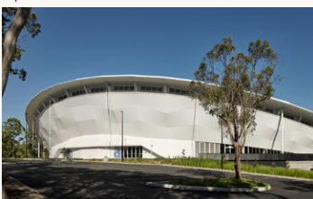
Anna Meares Velodrome, Chandler, Brisbane