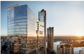
360 Queen Street, Brisbane