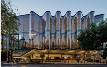
The Glasshouse Theatre, South Bank