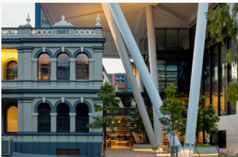
Jubilee Hotel Refurbishment, Fortitude Valley