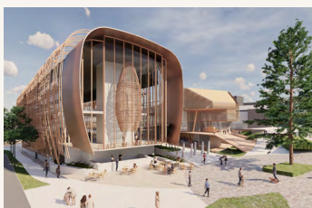
South Bank South Master Plan