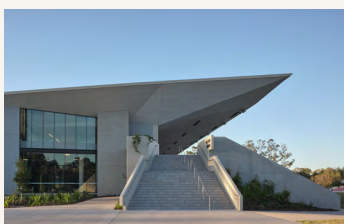
National Rugby Training Centre, Ballymore