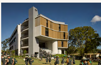
The Marian Centre, Brigidine College