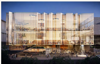
New Performing Arts Venue, South Bank