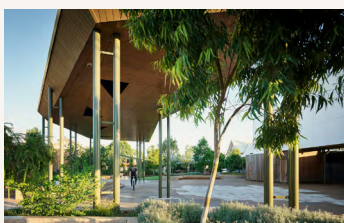
Mary's Place, Dalby