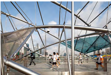
HELIX PEDESTRIAN BRIDGE, SINGAPORE