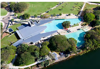
THURINGOWA RIVERWAY, TOWNSVILLE