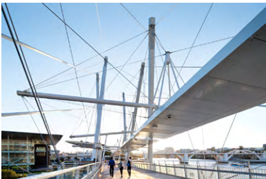
KURILPA PEDESTRIAN BRIDGE, BRISBANE