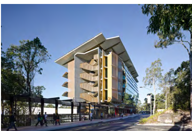
SIR SAMUEL GRIFFITH CENTRE, BRISBANE